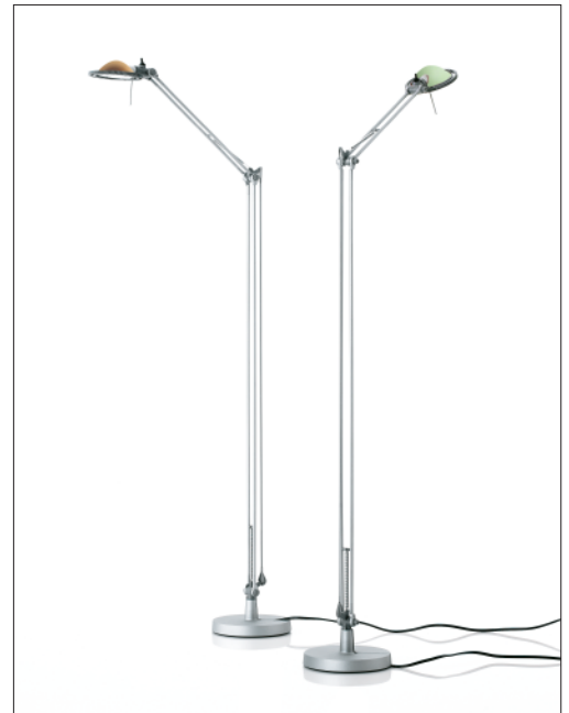
D12 EL t.