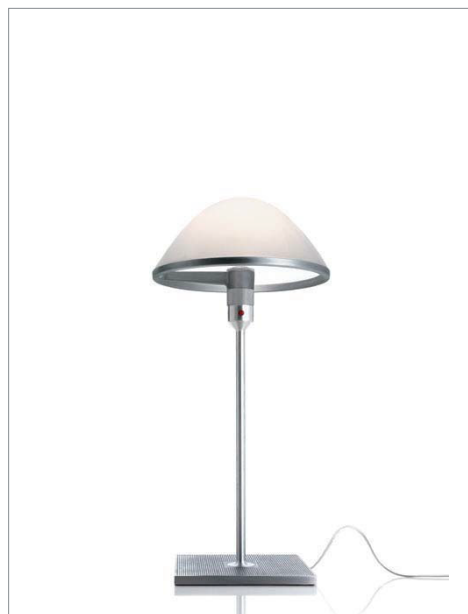
D60 (dimmer) - D60i