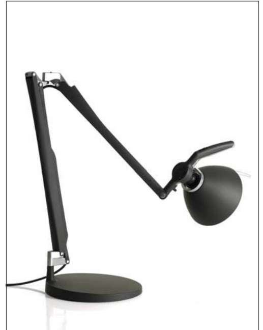
D33N.100 on/off switch

Reference code: D33N.100 1D33N2GI0002 white 1D33N2GI0001 black soft touch 1D33N2GI00AA metal Component D33N/1 1D33N/010002 base white 1D33N/01000A base metal 1D33N/010001 base black soft touch D33N/3 1D33N/03000A universal joint metal D33N/4 1D33N/04000A clamp metal D33N/5 1D33N/05000A fixing pin