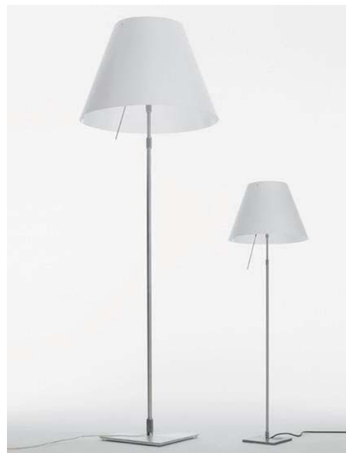
D13G t. - D13G t.i

Reference code: D13G t. 1D13GTDH0020 alu D13G t.i. 1D13GTIH0020 alu